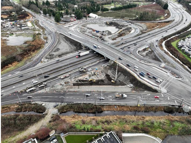
Figure 1: February 3, 2026, drone image of the SIP Project site looking southeast.