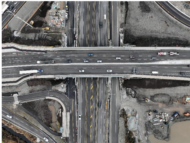
Figure 3: February 3, 2026, drone image detailing the new five-lane overpass spanning Highway 99.