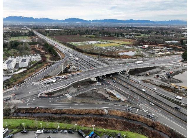
Figure 2: February 3, 2026, aerial photo of the new overpass looking northeast.