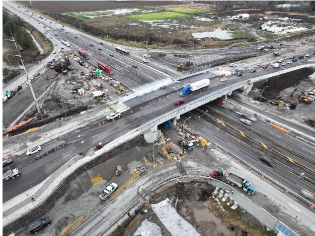
Figure 1: Drone image of traffic on the Phase 2 structure ahead of opening all five lanes to traffic.