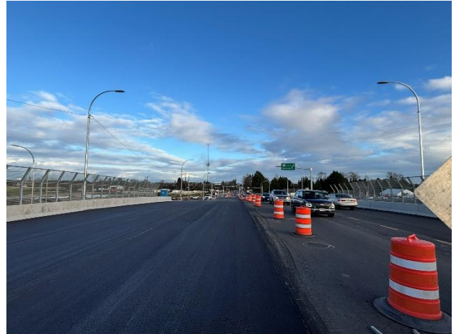
Figure 2: East facing view of fresh Phase 1 paving prior to opening all lanes to traffic.