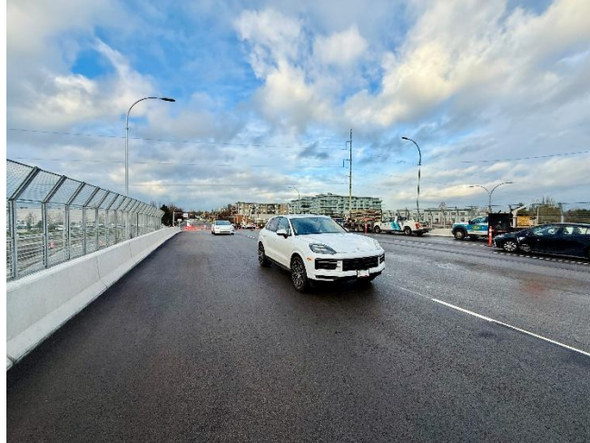
Figure 3: Vehicles on the new interchange the morning it opened all five lanes to traffic, December 23, 2025.