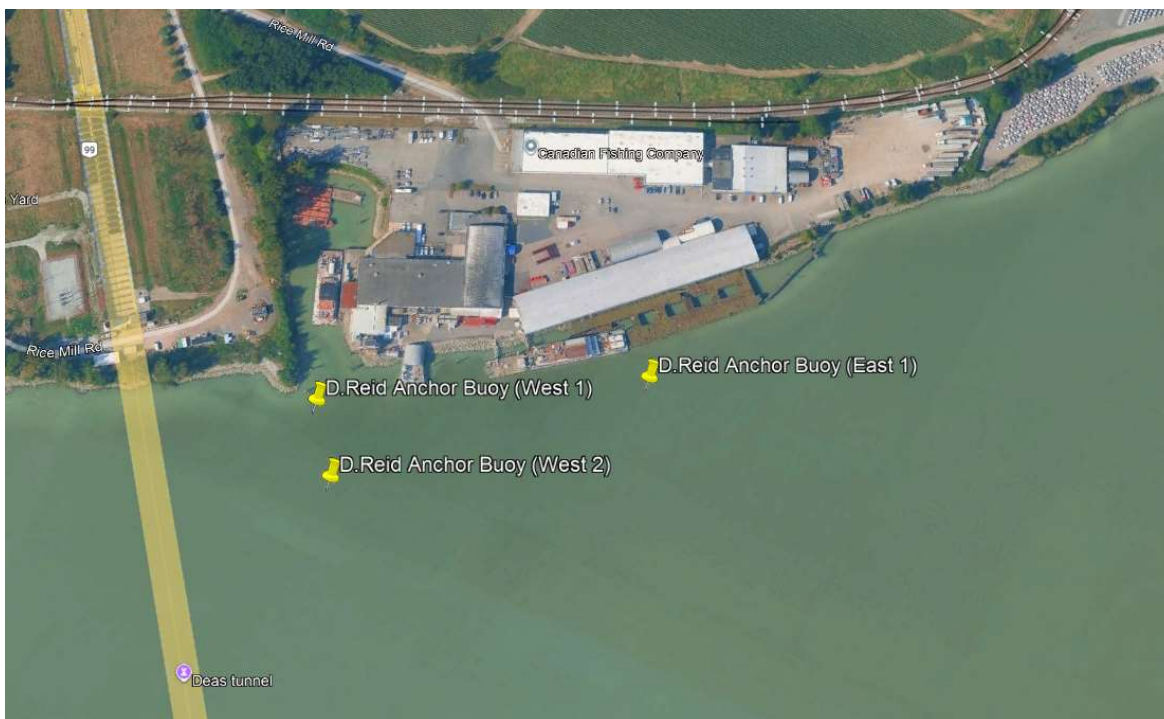
Figure 3: Derrick Barge Anchor Positions

Channel 16 for the Canadian Coast Guard – Emergency, Channel 74 for the Canadian Coast Guard.