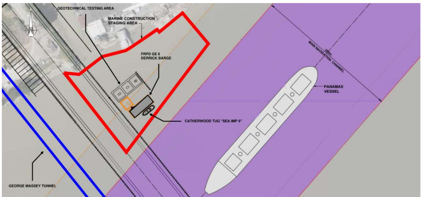
Figure 1: Work Area

Specific marine construction staging equipment locations will be noted on the project daily notifications, issued daily to the Fraser River Pilots and Council of Marine Carriers before 0800h each day.