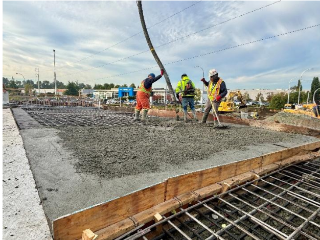
Figure 1: Crews spreading and smoothing concrete on the Phase 2 west approach.