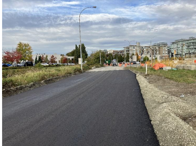
Figure 3: Full-depth reconstruction of the southbound Highway 99 on-ramp.