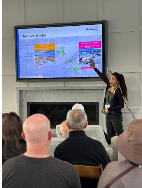
Figure 1: Project-team members provide details about in-river work to residents of Hampton Cove. (Oct. 8, 2025).