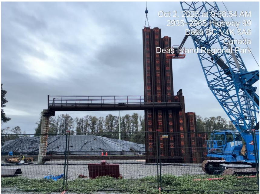
Figure 2: Testing sheet piling on Deas Island within the Ministry's right-of-way. (Oct. 2, 2025)