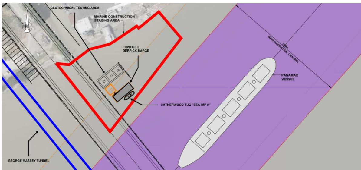
Figure 1: Test Area (In-River Test Section)