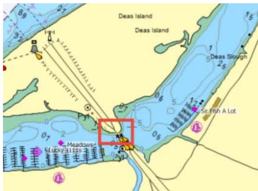
Figure 3: Deas Slough Bridge Work Area

Channel 16 for the Canadian Coast Guard – Emergency, Channel 74 for the Canadian Coast Guard.