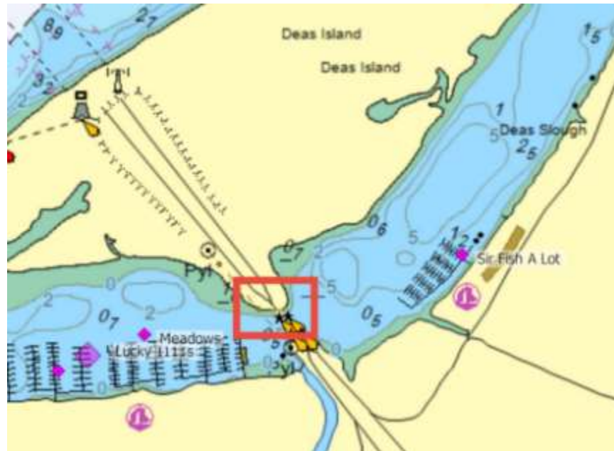
Figure 3: Deas Slough Bridge Work Area