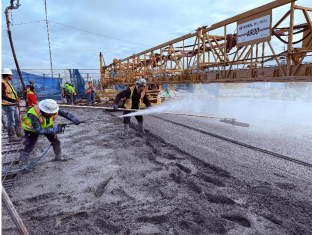
Figure 1: Crews spreading and smoothing concrete on the Phase 2 overpass deck.