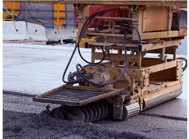
Figure 2: Concrete paving machine at work during the Phase 2 deck pour.