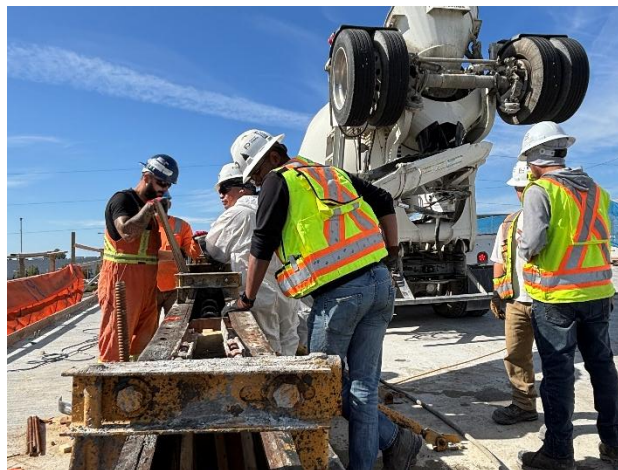
Figure 3: Crews pouring the Phase 2 concrete barrier separating the future sidewalk from bicycle and vehicle lanes.