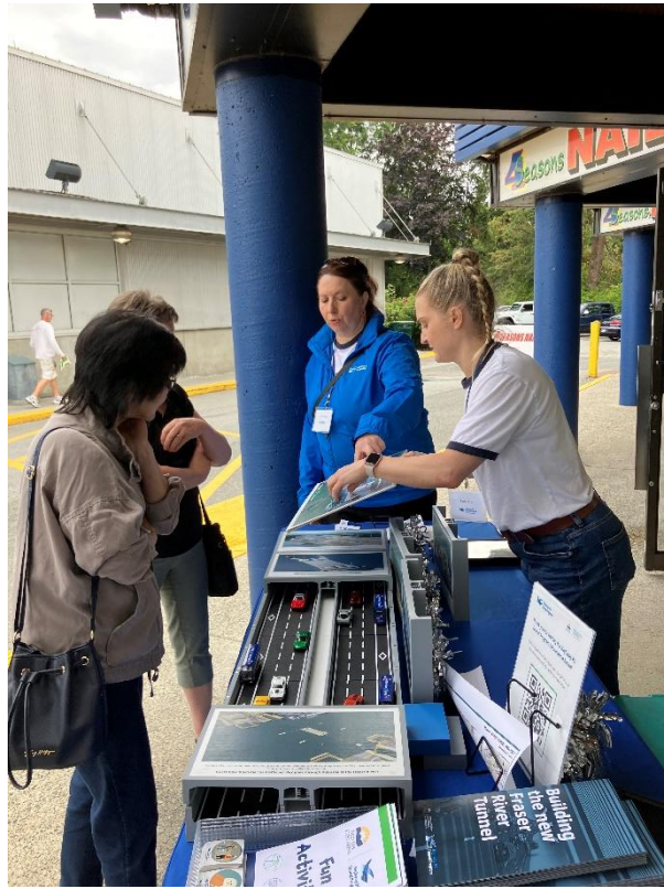
Figure 1: Project staff interact with visitors at an engagement event at the Highway 99 Tunnel Program community office. (July 9, 2025)