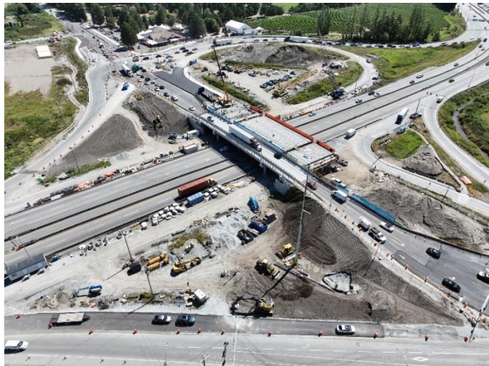
Project site looking southeast (August 11, 2025).

With the girders now set, work is progressing to construct the Phase 2 bridge deck, as the Project looks ahead to completion in fall 2025.