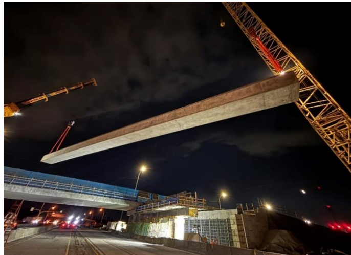
Heavy-lift cranes on either side of Highway 99 hoist a main-span girder into place (July 19, 2025).

Visit our website for more on the construction phases for the Steveston Interchange Project and traffic impacts related to current work .