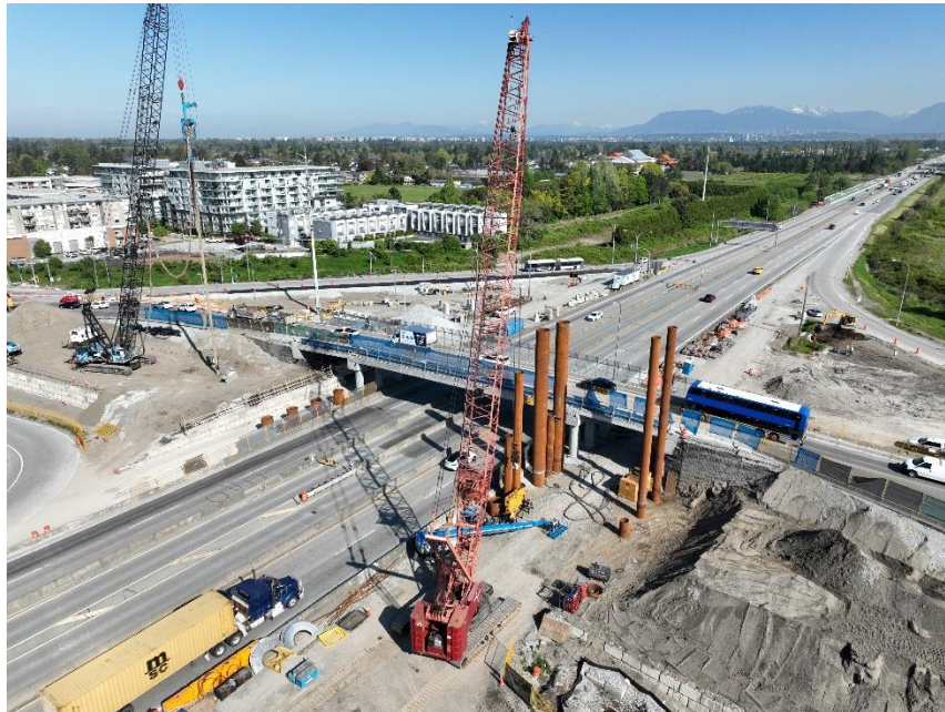
Figure 3: North-facing drone image of the Project site showing Phase 2 work underway next to the completed Phase 1 structure.