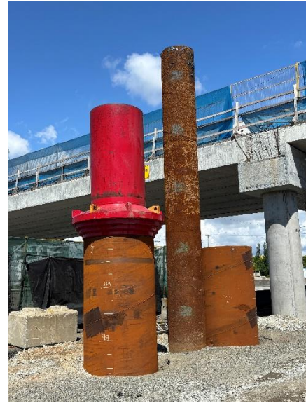
Figure 2: Diesel hammer impact block (pictured in red) for Phase 2 pier pile driving.