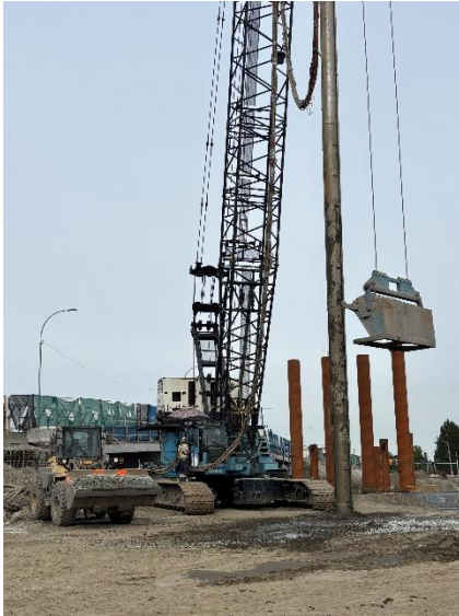
Figure 1: Phase 2 stone column work in the southwest quadrant.