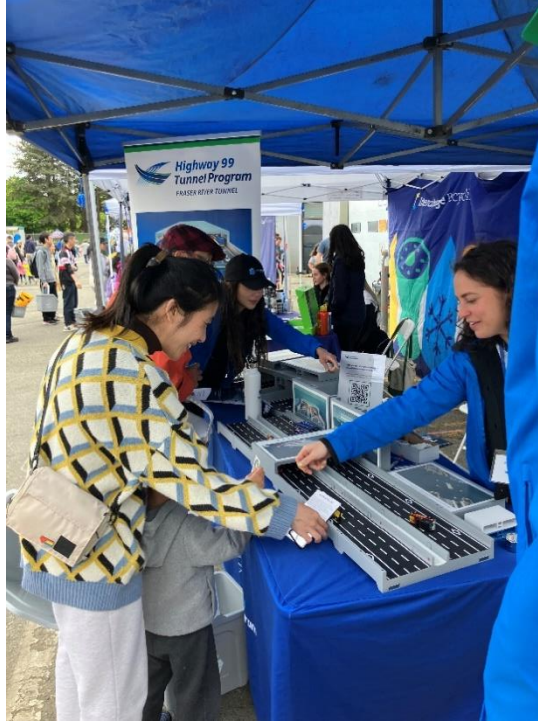
Figure 1: FRTP team discusses the Project with members of the public at City of Richmond Public Works Open House.