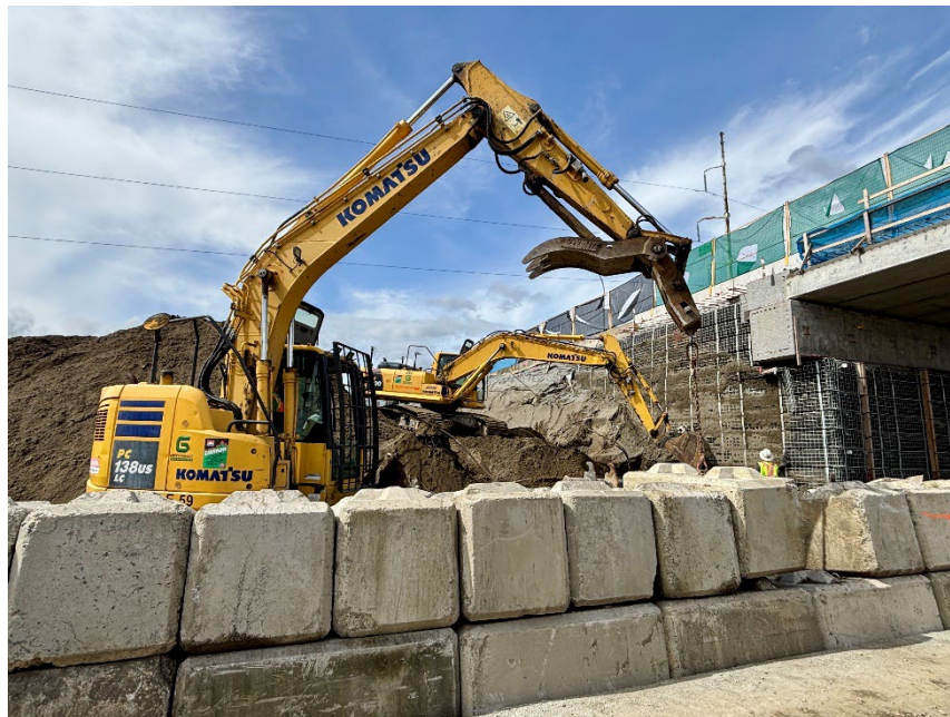
Figure 3: Excavators build a temporary retaining wall in the southwest quadrant.