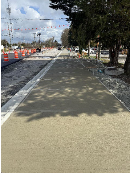
Figure 1: Newly poured sidewalk in front of Richmond Country Farms on Steveston Highway east.