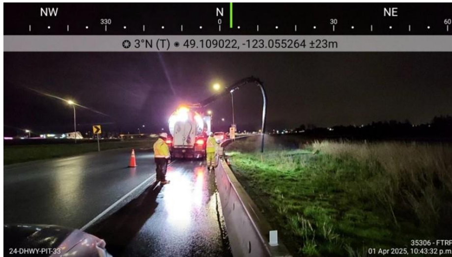
Figure 1: Crews conducting overnight geotechnical investigations in Delta at the Highway 99 off-ramp leading to Highway 17A.