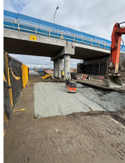
Figure 2: Preparing for paving Highway 99 after the removal of the original overpass pile caps.