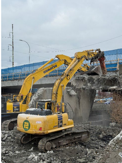
Figure 1: Excavators removing the original overpass so the Phase 2 structure can be built in its place.