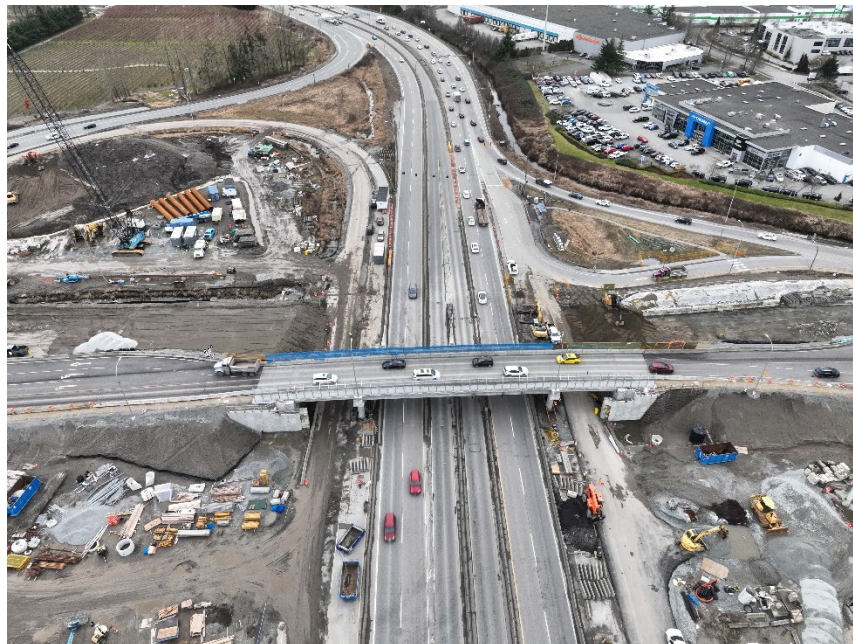
Figure 3: South-facing view of the Project site with the original overpass removed and traffic flowing on the new Phase 1 structure.