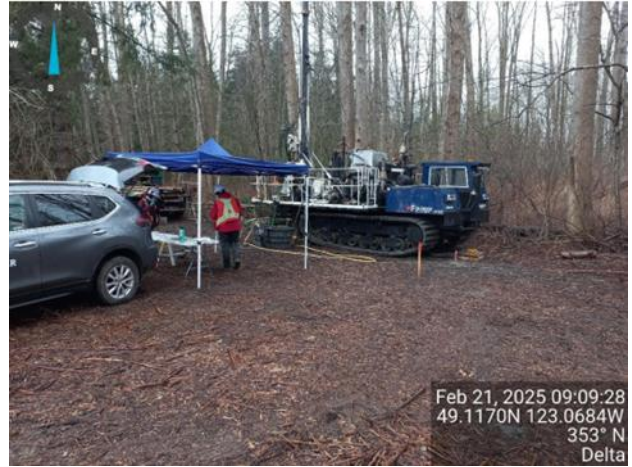
Figure 2: Tracked rig used for onshore geotechnical works around Millennium Trail in Delta.