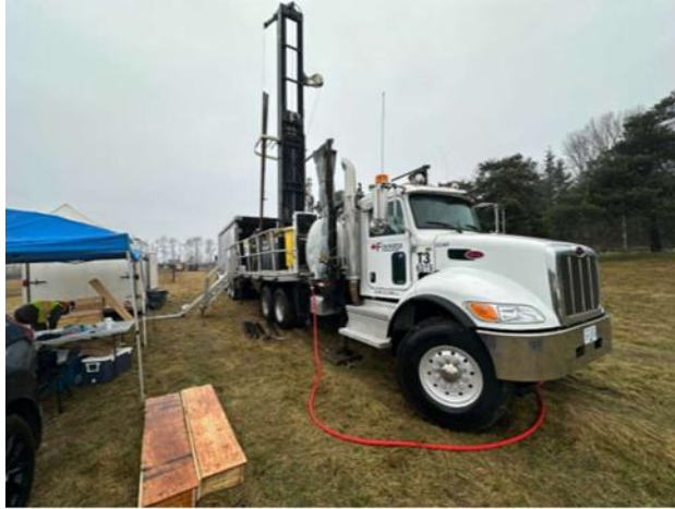
Figure 1: Drilling rig for onshore geotechnical investigations