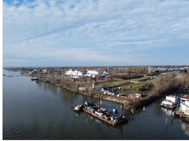
Figure 2: Marine geotechnical investigations work being conducted in the Fraser River near the George Massey Tunnel.