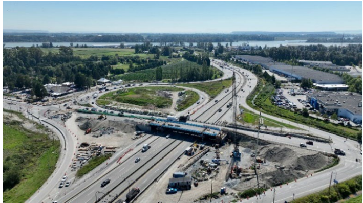
Looking south at the Steveston Interchange Project (September 2024).

The Steveston Interchange Project is marking a major milestone with the completion of the north half of the new five-lane overpass. Next steps include completing the eastbound traffic move onto the new north structure, removing the existing overpass, and starting construction on the new south half in its place.