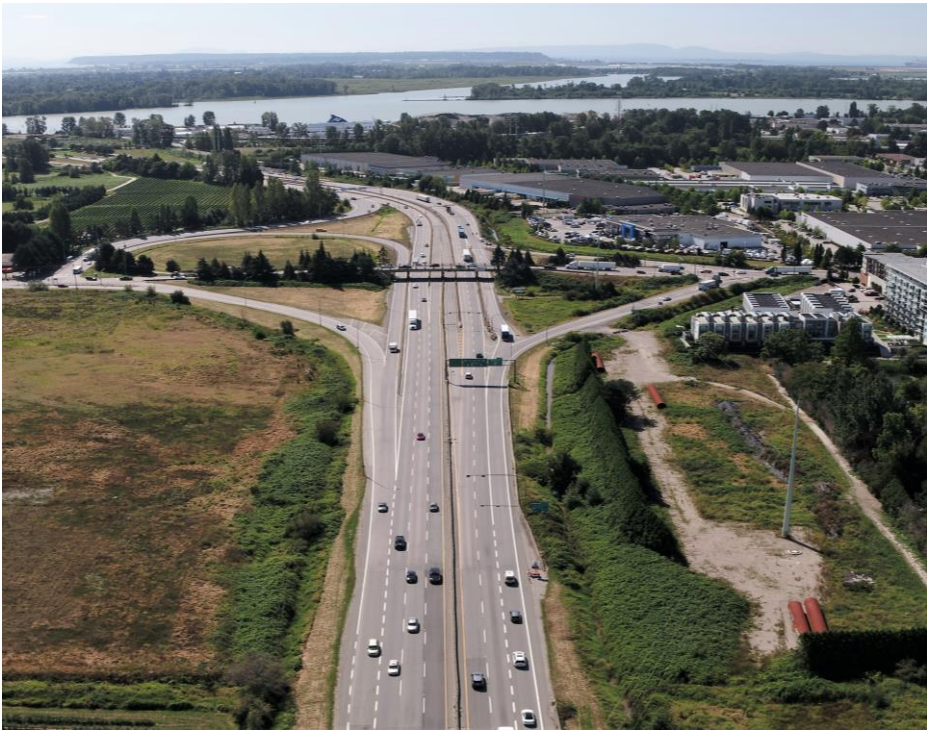
FIGURE 1 – AERIAL VIEW OF PRESENT-DAY STEVESTON INTERCHANGE