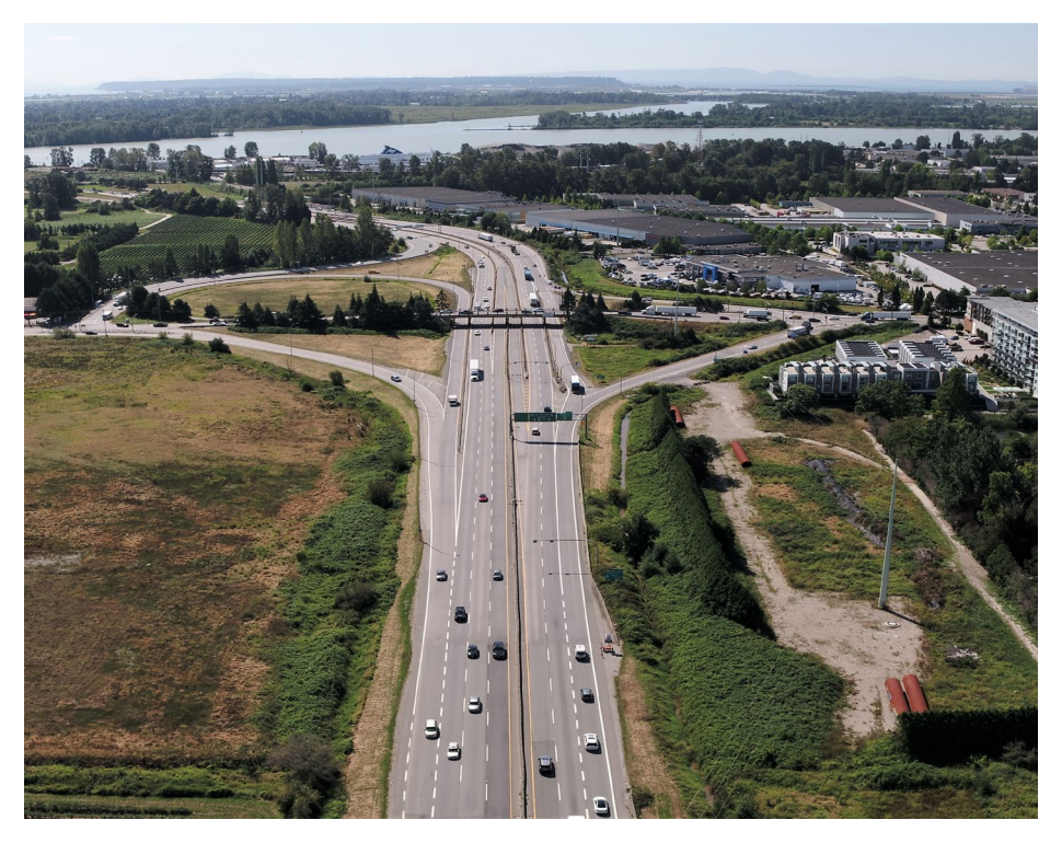
FIGURE 1 – AERIAL VIEW OF PRESENT-DAY STEVESTON INTERCHANGE